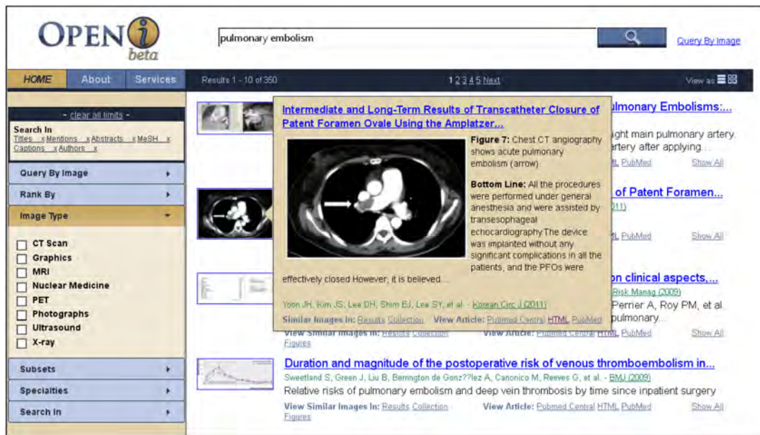
Fig. 1. Textual search results in the list view of the Open system. The navigation panel on the left allows filtering and sorting search results along several facets. The pop-up window that appears on scrolling over the image provides a brief, but key, summary of the information in the article.